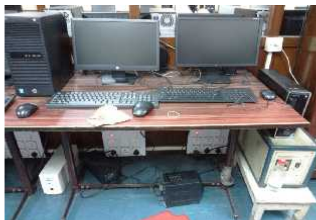
Teaching-Learning facilities – Computers (PG)