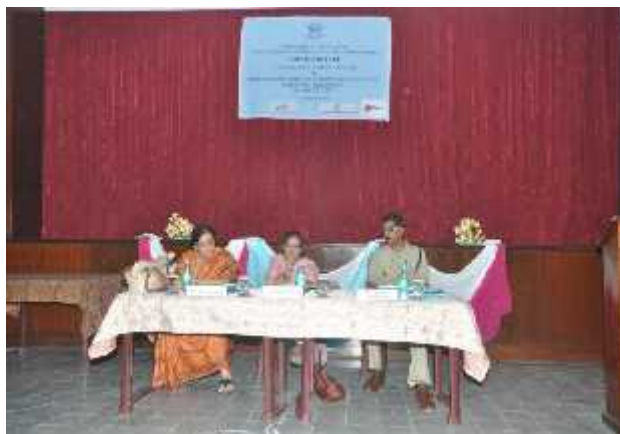
Education, Human Rights, Journalism & Mass Communication Inter-disciplinary