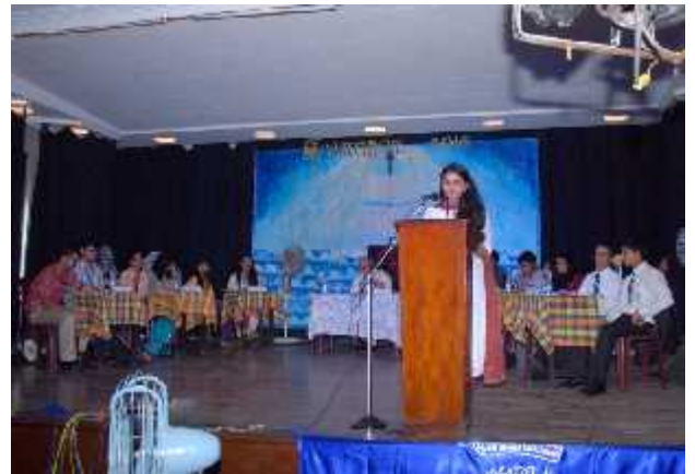
Students' Meet - Ecolore