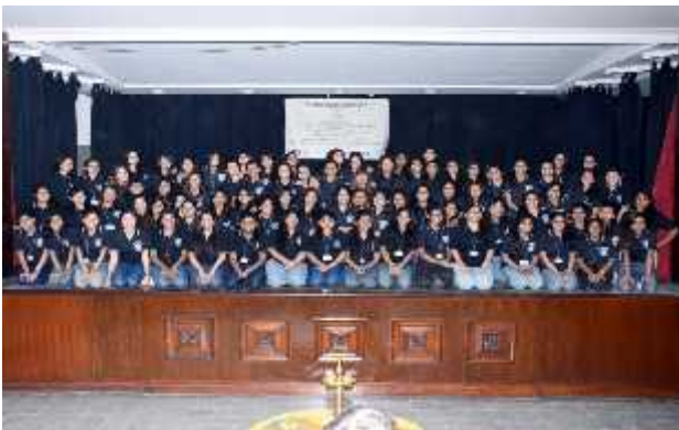
Psychology Department Seminar