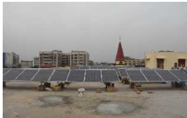
Solar Photo-voltaic Panels – Green Campus