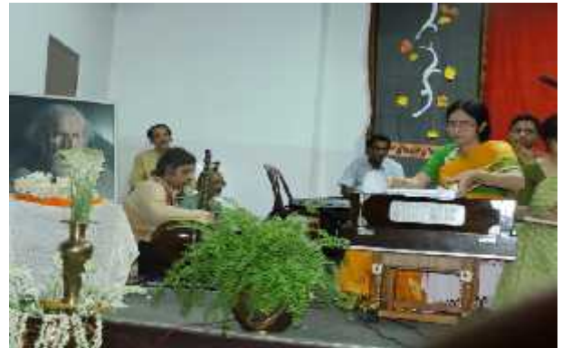
Rabindra Jayanti Programme