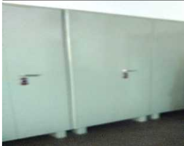
Teaching-Learning facilities – Classroom furniture (UG)