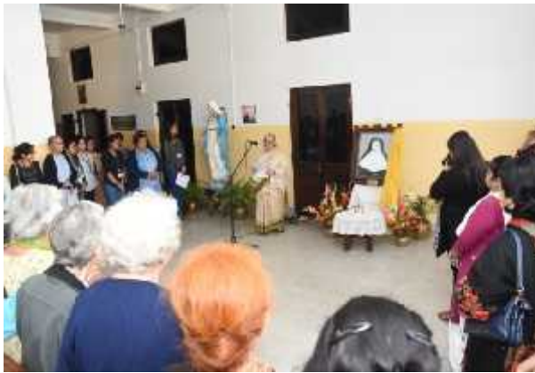
Foundation Day 2016