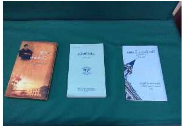
Publications by the English Department