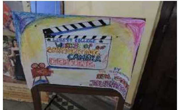
Workshop on Script, Camera, Light