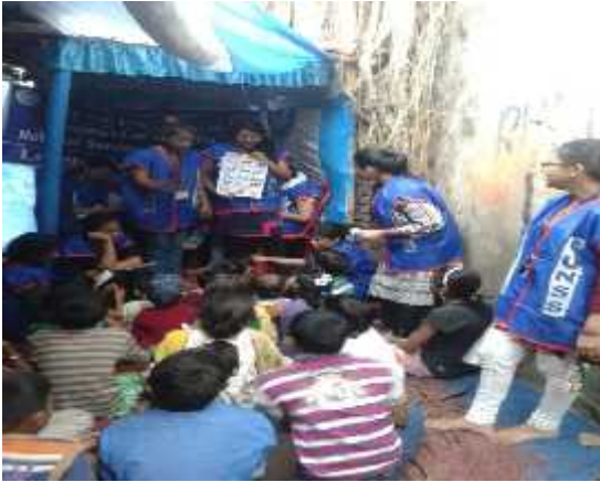
NSS Slum Camp