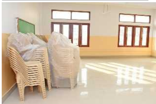
Teaching-Learning facilities - Classroom furniture (UG)