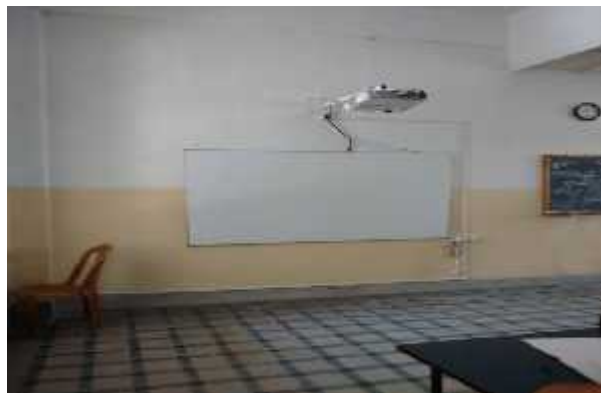
Enhancement of Teaching-Learning facilities (UG)