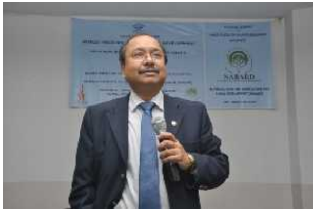
Economics Department Seminar