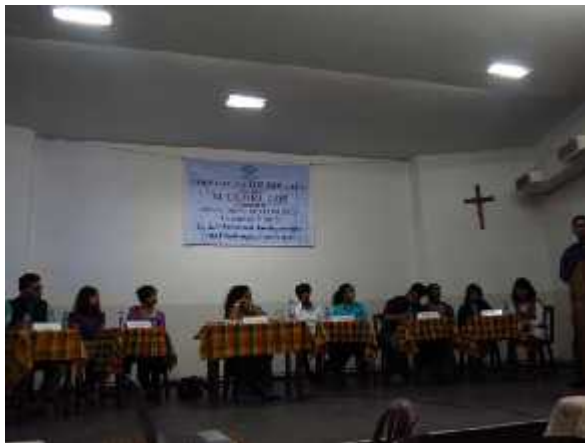
Cultural Fest - Samagam