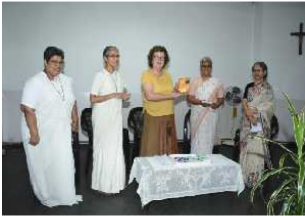
Book Release by Mother General