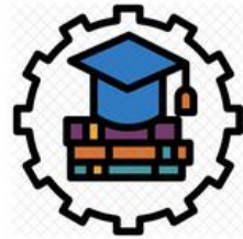
Academic Management System