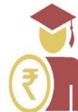
Fees Management System