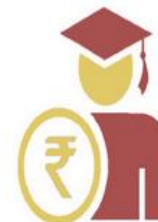
Fees Management System